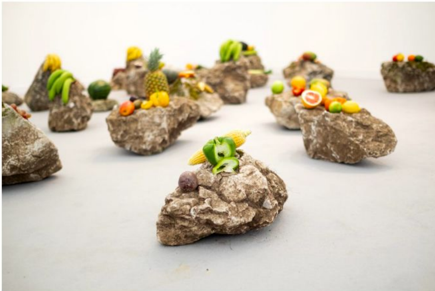
The Echo of an Ancient Form of Knowledge, (Ru k' ox k'ob'el jun ojer etemab'el), 2021.

In a first for the institution, Tate has acquired custodianship of an artwork—as well as the Mayan ritual needed to install it.