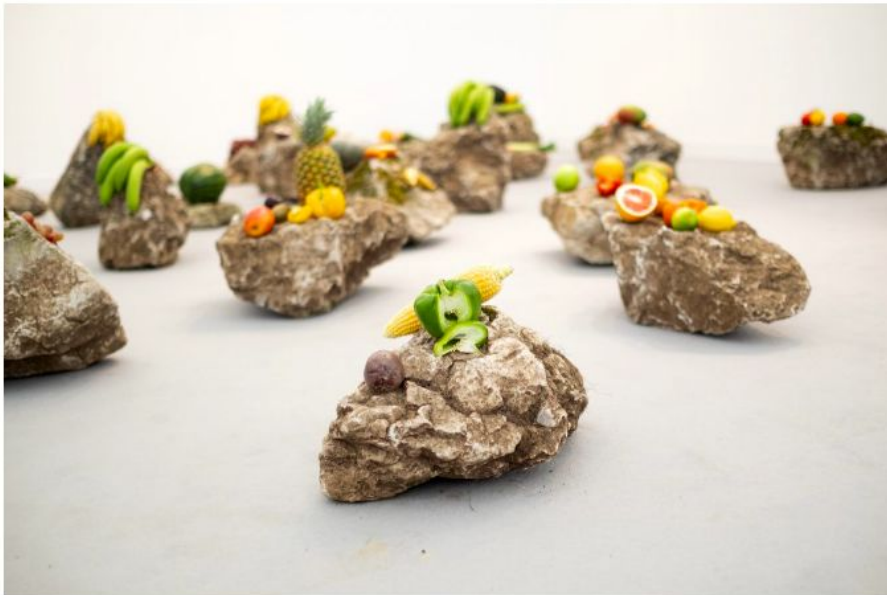
The Echo of an Ancient Form of Knowledge, (Ru k' ox k'ob'el jun ojer etemab'el), 2021.

In a first for the institution, Tate has acquired custodianship of an artwork—as well as the Mayan ritual needed to install it.